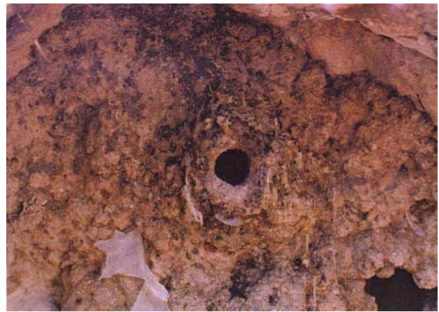
( Sitta neumayer )