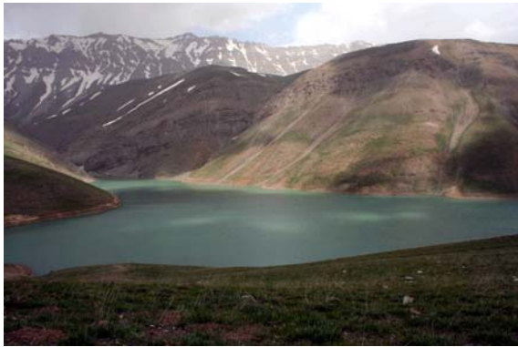
Figure 1. View of Lake Tar, © M. Tohidifar.