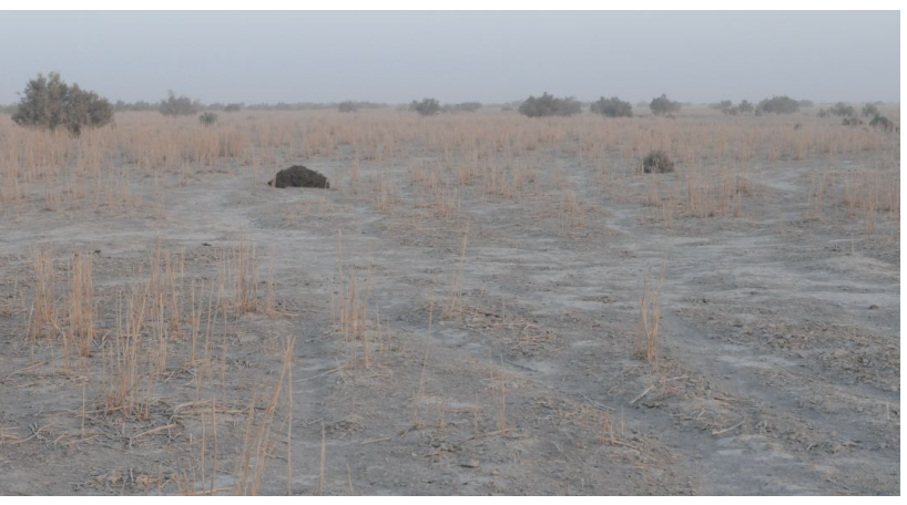
Fig. 4. A view of the habitat of Sistan Scrub Sparrow in the dry basin of Saberi lake. December 2010, R. Ayé.

While it is not excluded that the observed birds left the area later in the year or in January, we do not consider this likely and our observations rather suggest that at least part of the population is sedentary. Christison (1941)and later Summers-Smith (1988), Clement et al. (1993) and Kirwan (2004) suggested that the taxon was migratory, wintering in the Chagai desert of