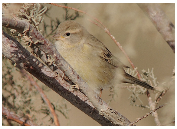
Fig. 3. The yellowish colouration of the underparts of yatii is also visible in many females under favourable conditions, Saberi lake, December 2010, R. Ayé.