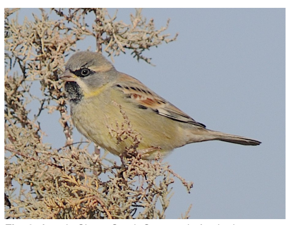
Fig. 2. A male Sistan Scrub Sparrow in fresh plumage, Saberi lake, December 2010, R. Ayé.

At least 300 Sistan Scrub Sparrows were found in the dry basin of the Saberi lake in the morning of 15 December 2010 (Figs. 2-3). Due to security concerns, the authors were not allowed to walk further than about 1.5 km into the basin of the lake. The site of the observation was 31°02'40"N, 61°19'26"E, i.e. about 1.2 km into the basin of the lake. The species was found in a dry reed-bed with tamarisk bushes (about 5% coverage for tamarisk estimated). Reed Phragmites was still present with high coverage, but completely dry (Fig. 4). All but a few reed stems were broken at heights of mostly 0.3 to 1.0 m above the ground. At the time of the visit, the reed-bed was being grazed by sheep and goats. The birds were feeding on some parts (the seeds?) of the tamarisk bushes (Tamarix gallica) and apparently also on dung on the ground and on seeds of reed.