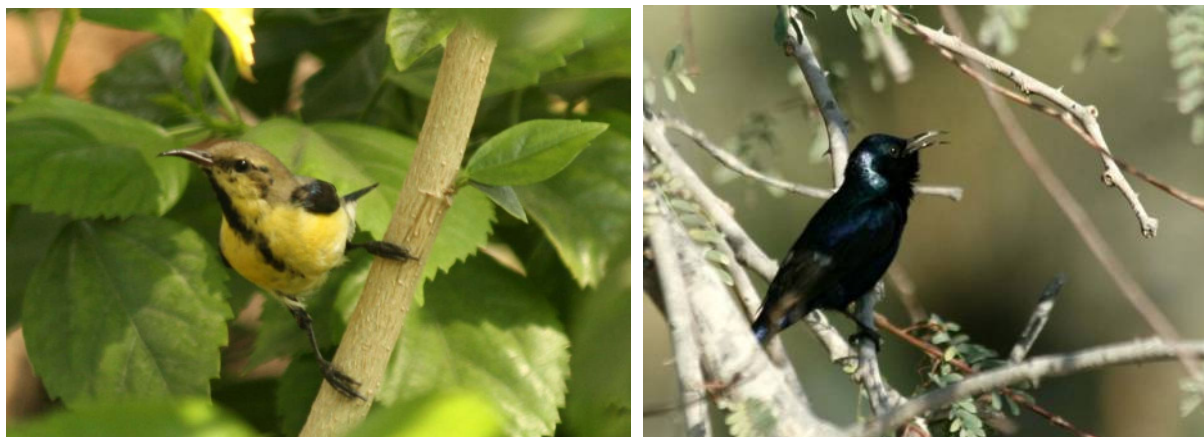
Figure 2. Male Purple Sunbird, Left ) in breeding season, Right ) pre-breeding plumage, © T. Ghadirian.

In Iran, the male plumage lacks any shiny black appearance in autumn. In November after the mating season, it has a light yellow breast and belly, a dark brown back and a dark line on the chin, throat and belly: this plumage remains through the winter season. After this plumage has moulted completely, in spring the male develops a shiny black appearance, but with violet and green to blue reflections around its head and neck (Fig. 2).